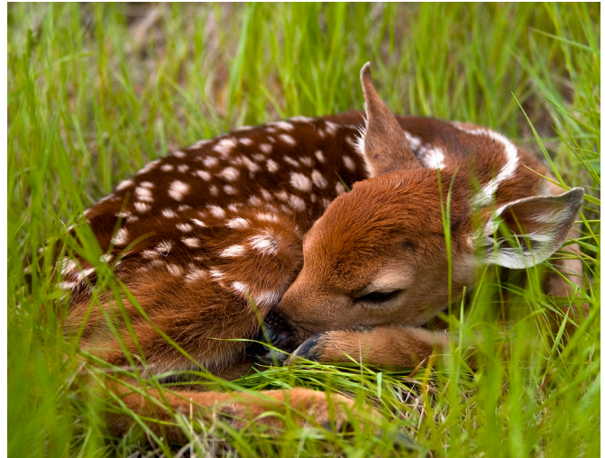
White-tailed deer fawns are born in July and August in Alabama.

Why don't does spend more time with their fawns? They don't spend much time with their newborn fawns because they want to reduce the chance that a predator may find the fawn. Deer fawns are nearly scentless at birth; however, the doe is not scentless. She smells like a deer. The more time she spends around the fawn, the more scent she leaves in the area, and the greater chance a predator may key in on her scent to find the fawn. Additionally, her behavior when around the fawn may cue predators that a fawn is in the area. Although the fawn is capable of walking soon after it's born (similar to horses), it is still relatively weak and can't outrun most predators. It's in the fawn's best interest to hide and remain still until it is developed enough to outrun predators.